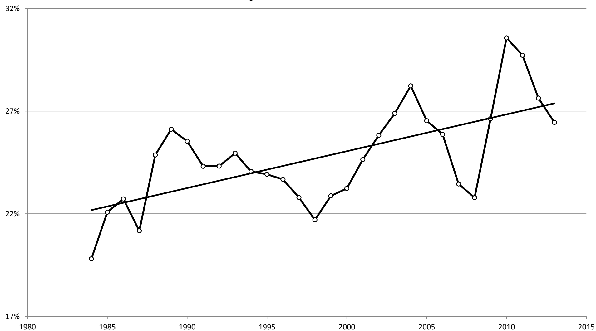
February 2014 , Source: The Office of the Utah State Auditor - Utah Single Audit Reports, State of Utah - Comprehensive Annual Financial Reports State of Utah Expenditures include appropriated and non-appropriated funds, all Governmental, Business-type and Component Unit Activity (eg, Universities)